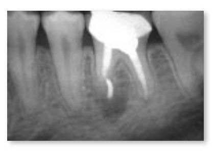
Fig. 6b: Root-end resection and MTA root-end filling of the mesial canals and intercanal isthmus

Modified zinc oxide-eugenol (ZOE) cements are popular for root-end filling procedures. Intermediate restorative material (IRM) and super ethoxybenzoic acid (SuperEBA) are two reinforced zinc oxide-