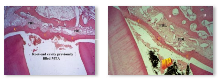
Figs. 7a and 7b: Histologic sections from two monkey teeth with MTA as root-end filling material showing formation of cementum (C). Adjacent to cementum that covers the entire resected root ends, normal periodontal ligament (PDL) and bone (B) are observed

Endodontic surgery is not "oral surgery" in the traditional sense. Rather, these procedures are