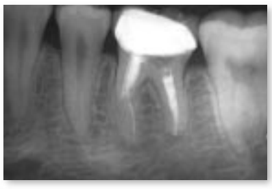
Fig. 6a: Irretrievable separated instrument in a mandibular first molar requires surgery

years in an attempt to create an ideal apical seal. For many decades, amalgam was the most popular material for root-end fillings. Amalgam is no longer considered an appropriate rootend filling material because long-term exposure of this material to body fluids results in corrosion and leakage. Researchers identified other materials superior in both biocompatibility and sealing abilities.